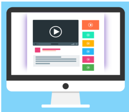
Do an exercise video.