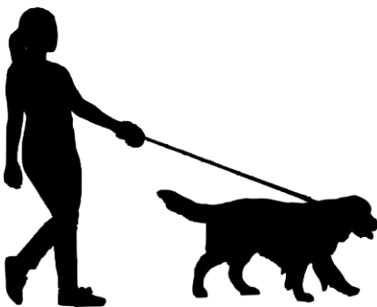
Walk your dog.