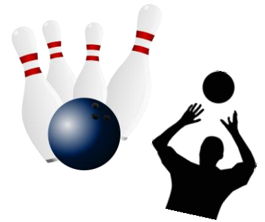
Join Special Rec.