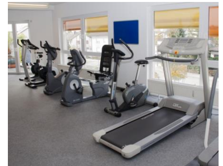
Use exercise equipment.