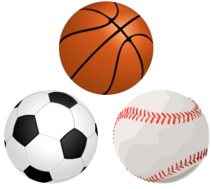
Play a sport.