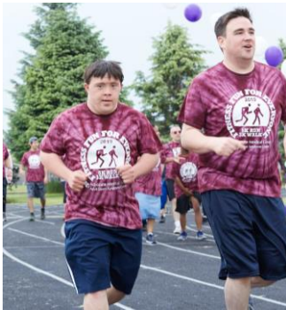
Go for a jog.