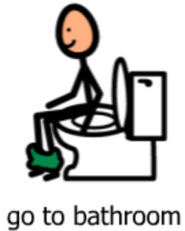
go to bathroom