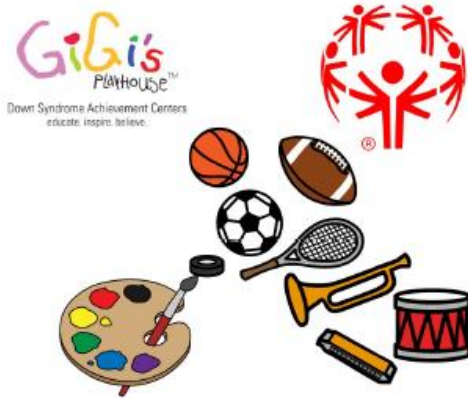
Has similar interests