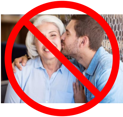
Is close in age