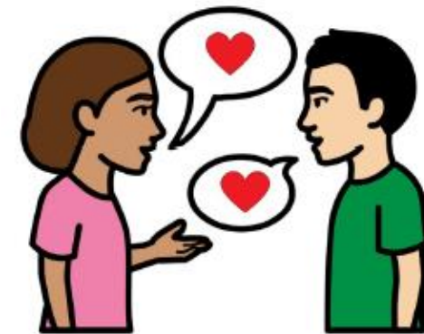
Likes you and wants to date you too